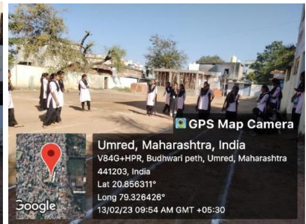
Shot Put Competition