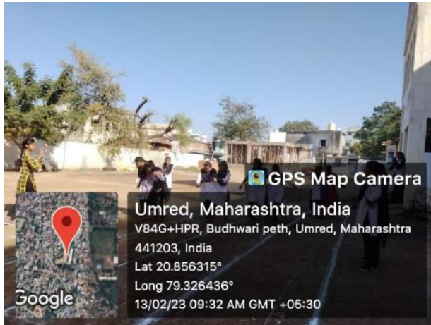
Word Memory Competition